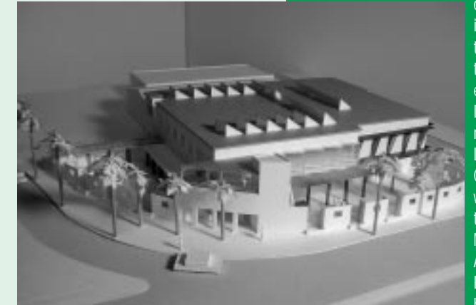
This artist's rendering shows what the new Safe Haven complex in Santa Monica, which will provide housing to persons with a mental illness.